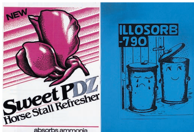
FIG. 9. Footwear and garbage-can zeolite deodorization products [Reproduced with permission from ref. 106 (Copyright 1997, AIMAT)].

Animal-Waste Treatment. Natural zeolites are potentially capable of (i) reducing the malodor and increasing the nitrogen retentivity of animal wastes, (ii) controlling the moisture content for ease of handling of excrement, and (iii) purifying the methane gas produced by the anaerobic digestion of manure. Several hundred tonnes of clinoptilolite is used each year in Japanese chicken houses; it is either mixed with the droppings or packed in boxes suspended from the ceilings (K. Torii, unpublished work). A zeolite-filled air scrubber was used to improve poultry-house environments by extracting NH_3 from the air without the loss of heat that accompanies ventilation in colder weather (93). Granular clinoptilolite added to a cattle feedlot ( 2.44 \text{ kg/m}^2 ) significantly reduced NH_3 evolution and odor compared with untreated areas (94). As more and more animals and poultry are raised close to the markets to reduce transportation costs, the need to decrease